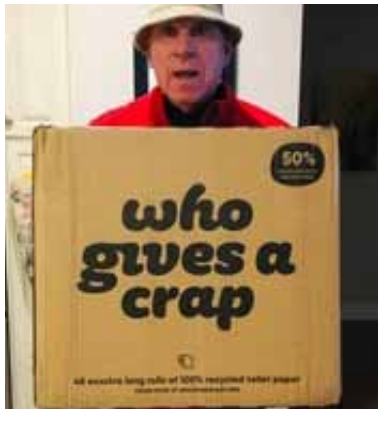
Mayor of Red Planet No TP shortage