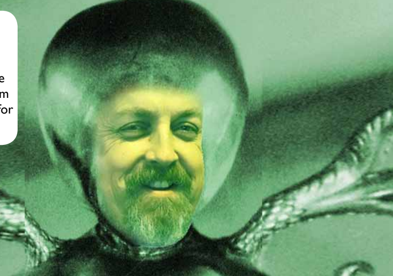
How you like them apples? I'm from Cambridge not Mars, although sometimes it's close